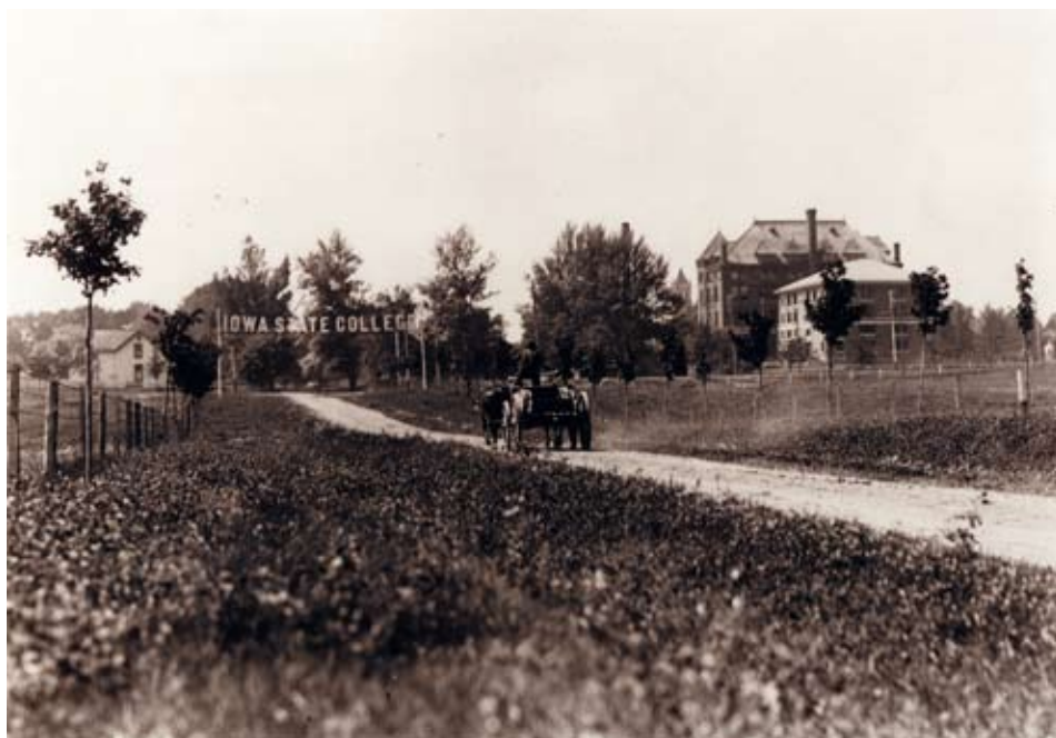
The entrance to Iowa State College in 1912.

Green hills for thy throne, And for crown a golden melody Ringing in the hearts of all Who bring thee love and loyalty; Dear Alma Mater, Make our spirits great, True, and valiant Like the bells of Iowa State.