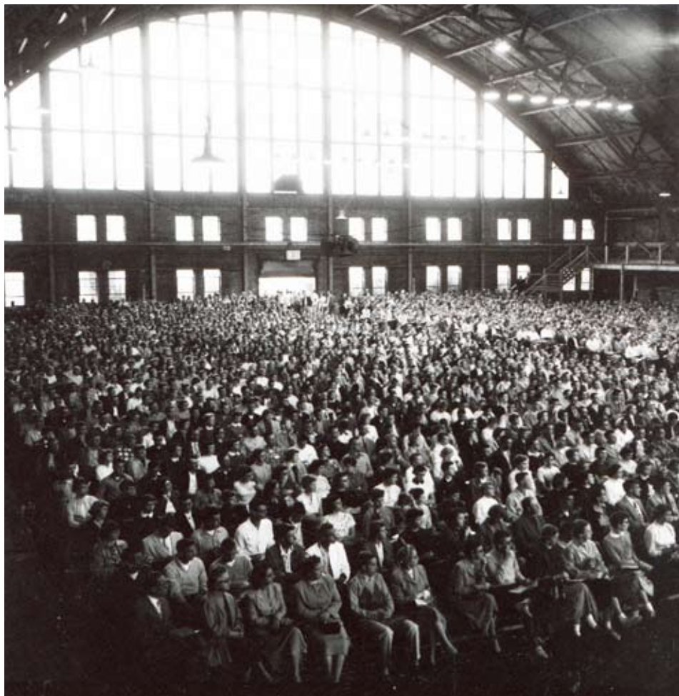
Freshman Days meets in the Armory, 1954.

Office of Institutional Research (Source: Office of University Relations)