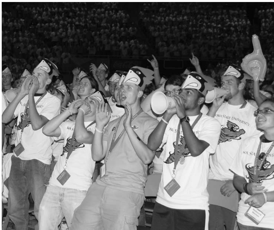
Destination Iowa State, 2008.