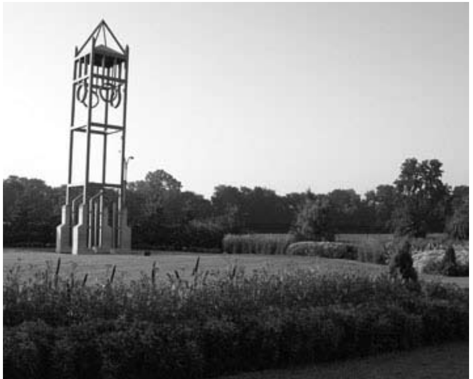
Reiman Gardens is the largest public garden in Iowa.

Established in 1995 through a gift by Bobbi and Roy Reiman. Now the largest public garden in Iowa, Reiman Gardens creates a striking entrance to Iowa State University and the city of Ames on a 14-acre site. The year-round facility features an indoor conservatory, 2,500-square-foot indoor butterfly conservatory, butterfly emergence cases, gift shop, and five supporting greenhouses. The Gardens provide opportunities for learning through a year-round education program and special events.